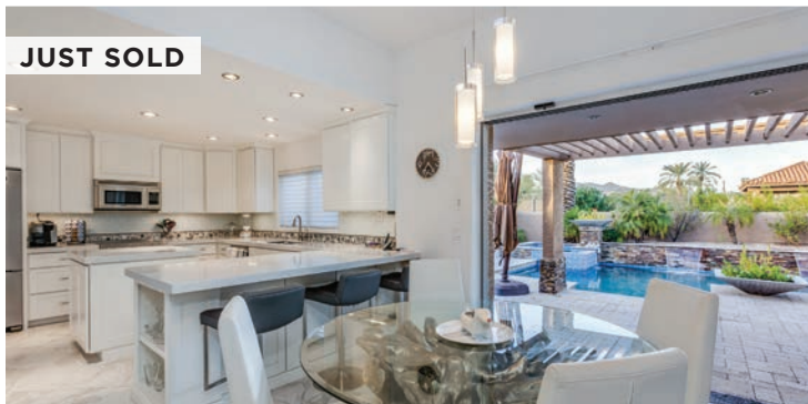
4430 E Camelback Rd #41, Phoenix, AZ 85018 2 Bed | 2.5 Bath | 2,818 Sq Ft