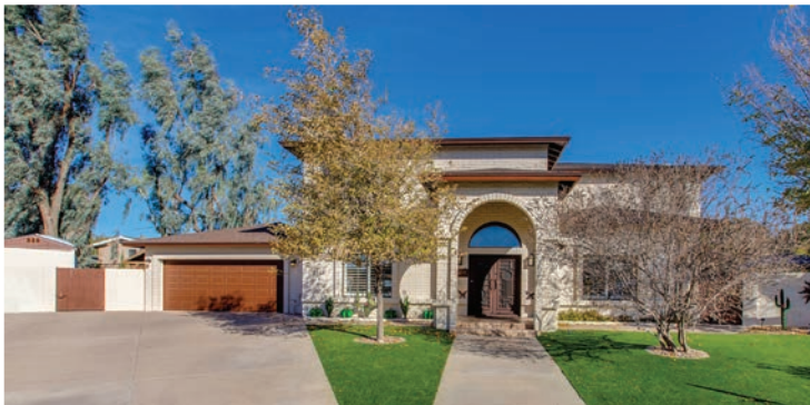
5148 N 35th St, Phoenix, AZ 85018 5 Bed | 4.5 Bath | Biltmore Heights