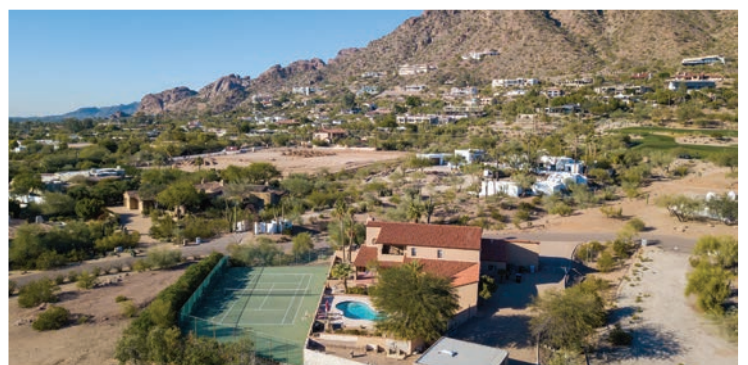
4611 N Alta Hacienda Dr, Phoenix, AZ 85018 4 Bed | 3.5 Bath | Arcadia Proper