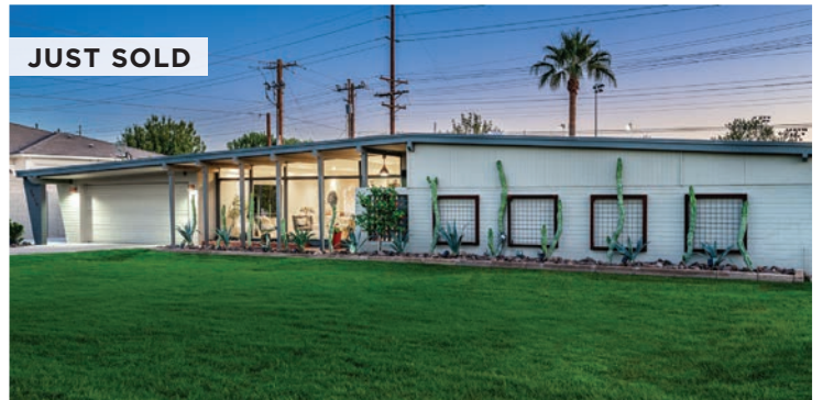
5419 E Calle Redonda, Phoenix, AZ 85018 4 Bed | 3 Bath | 2,4125 Sq Ft