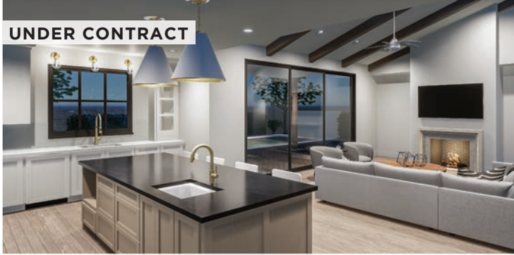
4030 E Hazelwood St, Phoenix, AZ 85018 5 Bed | 4.5 Bath | 3,885 Sq Ft | New Build