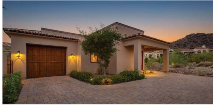
6600 N 39th Pl, Paradise Valley, AZ 85253 1b/1b Guest House on 2.3 Acres