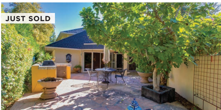
2108 E Pasadena Ave, Phoenix, AZ 85016 3 Bed | 4 Bath | 3,757 Sq Ft